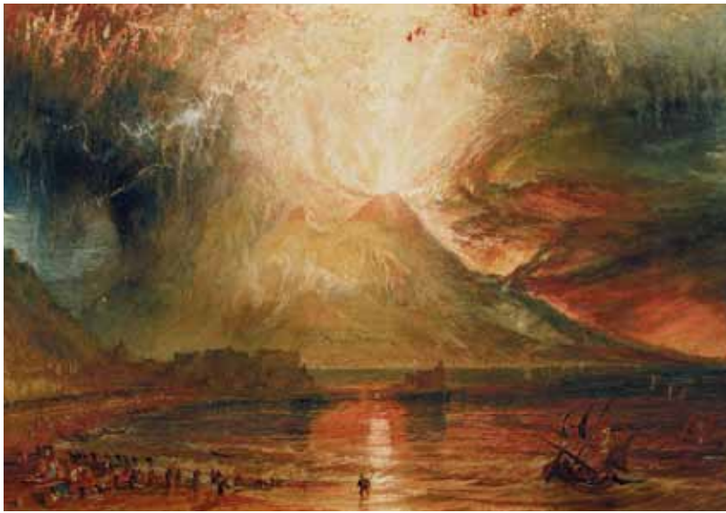
Above: Around 1817, British artist J. M. W. Turner created this painting of the volcano Mount Vesuvius. Experts believe that the color of the sky was inspired by what Turner must have seen over England in the years after Tambora erupted.

stronger than that of Krakatoa, history's most famous volcano, which erupted in 1883, also in what is now Indonesia.