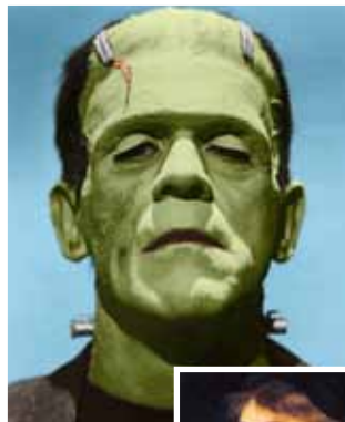
We can thank Tambora for Frankenstein . Mary Shelley (right) wrote the novel in stormy Switzerland during the endless gloom of 1816.

What people were paying attention to a year later, in 1816, was the terrible weather—snowstorms in the summer, floods that turned wheat fields into lakes, frosts that blackened millions of acres of farmland